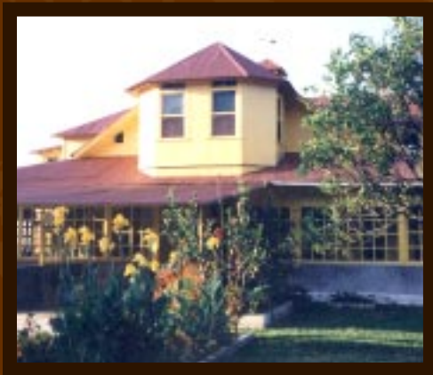
FINCA DOS MARIAS | Main House

We proudly serve Dos Marias Guatemalan Estate Coffee from Finca Dos Marias, where coffee growers share our passion for a quality cup.