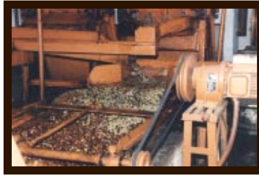
Inside the beneficio (mill) at Finca Dos Marias.